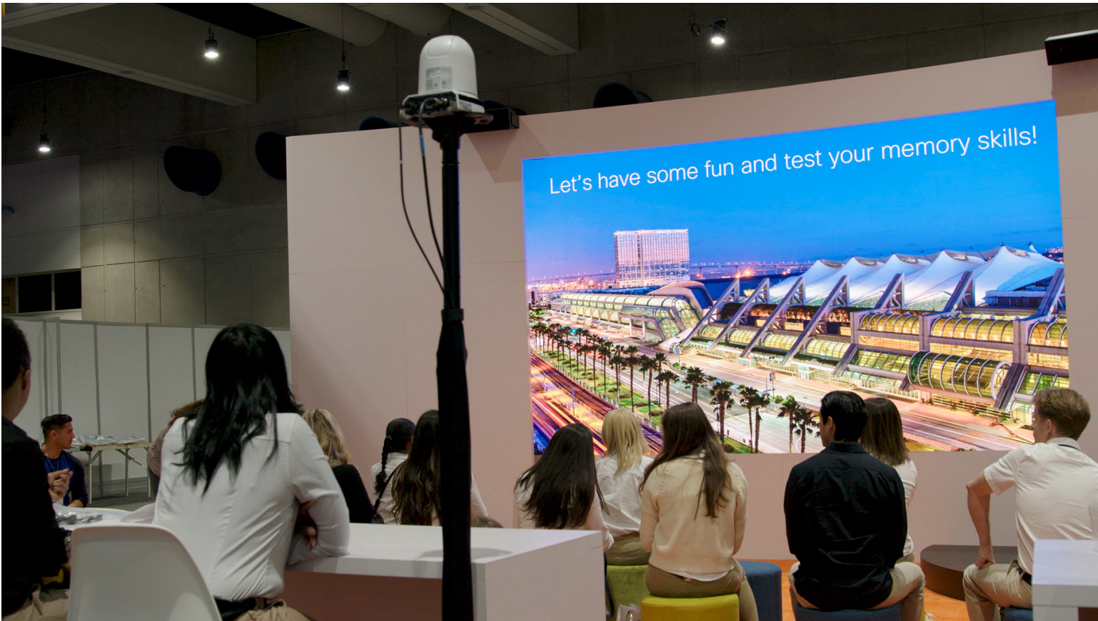
AW-UE70 cameras were installed in breakout rooms to capture hundreds of Cisco Live presentations.

These sessions are all posted to an “on-demand library” on the Cisco Live website ( https://www.ciscolive.com/global/on-demand-library.html?search=event=ciscoliveus2019#/ ), so that anyone can register to watch sessions anytime and anywhere. This original content is designed to educate viewers on Cisco products and technology, and to attract them to attend upcoming Cisco Live events.