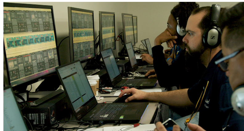
One operator can monitor eight AW-UE70s on a single laptop.

Eight operators managed the A/V equipment in the 63 rooms from a centralized control room, with an A/V manager on hand to monitor servers and the network. The task of each operator was to monitor and assist the Auto Tracking of the AW-UE70W/K PTZs, to register a face and