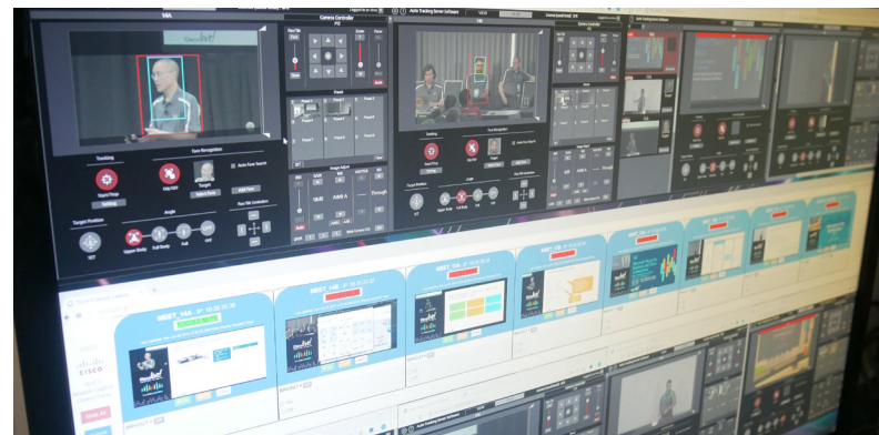
Eight PTZ camera feeds can be monitored on a single screen.

“Also, we needed to find a solution that was fast enough to track our presenters without interaction. Pretty much every other system we saw required some level of cooperation or interaction from your target. And that is something we just can’t accomplish when it comes to speakers who sometimes have only two to three minutes to get up on stage and start their presentation. The last thing they’re going to do is wait for you to take a picture of their side and their front.”