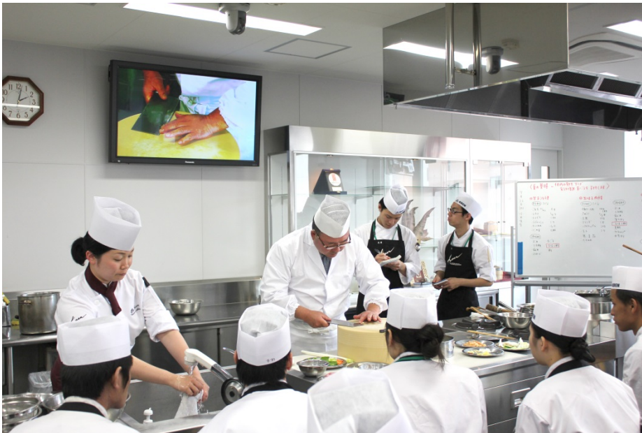
The Full-HD Cooking Camera System is used in practical classes such as Japanese cooking, Chinese cooking and confectionery classes. This picture is taken at a Chinese food training kitchen