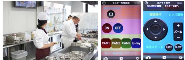
An assistant instructor operates the cameras with an iPod touch (right: home screen and camera operation screen)

In addition to the AW-RM50G wireless remote control, the cameras are controlled with iPod touch* which uniquely developed application software is installed. This app is designed to support the assistant instructor to operate cameras intuitively according to the movements of the instructor. Since AW-HE50HN and AW-HE60HN are IP compatible, it is easy to program camera control using mobile devices.