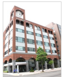
The well-equipped East building completed in October 2011

A total of 16 AW-HE50HN and AW-HE60HN HD Integrated Cameras are used in five training kitchens. Four have been introduced in the Chinese food training kitchen on the fifth floor of the East Building and three each have been introduced in the confectionery training kitchen and Western food training kitchen on the fourth floor and the confectionery/bakery training kitchen on the fourth floor of the Main Building. Footage is mainly used for explanations in practical cooking classes. Showing cooking demonstrations and examples of food arrangement on a large-screen monitor is used in various situations in practical cooking lessons, and allow students at the back to clearly understand the handling demonstrated by the instructor. The system is also used in the school's open lobby and the restaurants in which students work as chefs. Dynamic, high-quality footage is used as part of the unique, community-minded service provided by Koen Gakuen, with footage of lessons and the preparation of course meals in the restaurants transmitted to large-screen monitors in all of the buildings.