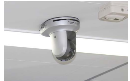
AW-HE50HN installed in a Chinese food training kitchen