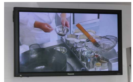
Clear footage of the instructor's hands is filmed and displayed even when zoomed in

Koen Gakuen Ecole de Cuisine Patisserie has started using the Full HD Cooking Camera System. Showing clear enlarged footage of the instructor's hands on a large-screen monitor allows effective teaching of cooking, improves the quality of lessons and helps instructors to run lessons smoothly.