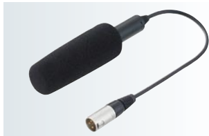
AG-MC200G XLR Microphone