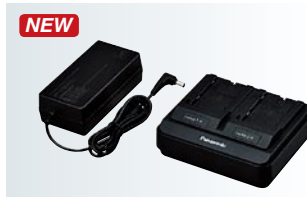
AG-BRD50 Battery Charger with Quick-Charge Capability *Quick-charge is not supported with the VW-VBD58, CGA-D54/D54s battery packs.