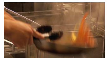
Undercranking (lower-speed shooting)