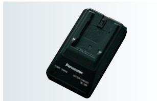
AG-B23 Battery Charger