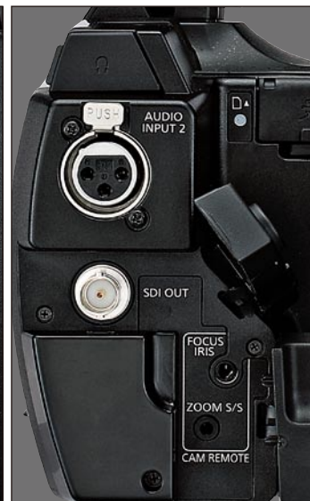
Side Terminal (when cover is open)