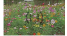
Electronic Level Gauge

The electronic level lets you easily confirm camera tilting on the LCD monitor screen. It helps to keep the camera level during handheld shooting, low-angle shooting and high-angle shooting.