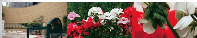
Wide 28 mm