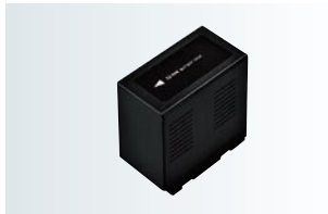
CGA-D54/CGA-D54s Battery Pack (5,400 mAh)