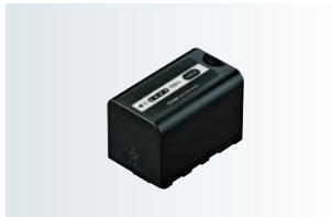
VW-VBD58 Battery Pack (5,800 mAh)