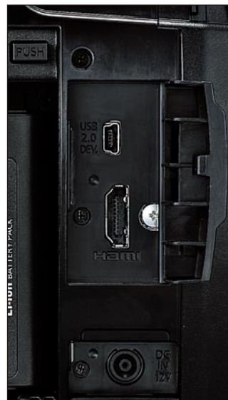
Rear Terminal (when cover is open)