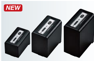
AG-VBR59 (5,900 mAh) AG-VBR89G (8,850 mAh) AG-VBR118G (11,800 mAh) Battery Pack (Quick-charge with AG-BRD50)