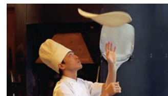
Overcranking (higher-speed shooting)