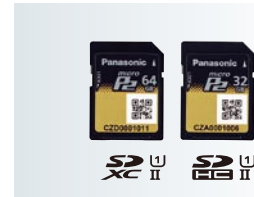
AJ-P2M064AG (64 GB) AJ-P2M032AG (32 GB) microP2 Card