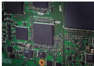
AVC-ULTRA Codec LSI

A security function featured on the microP2 card. The content recorded on the card is locked with a password to protect against unauthorized access. This prevents data from being stolen and enables secure media control.