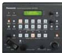
Remote Camera Controller