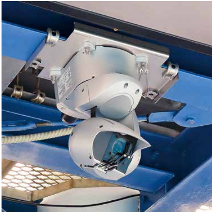
The AW-HR140 can be set up without housing and is installed under the large graphic display

Pan, tilt and zoom performance that fully captures the fast movement of the dolphins and high-quality video that clearly portrays the expressions of the trainer