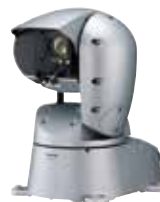
Full-HD Outdoor Integrated Camera