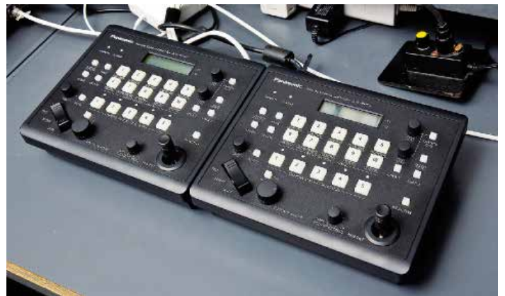
The AW-RP50 Remote Camera Controller enables simple camera control with the preset button