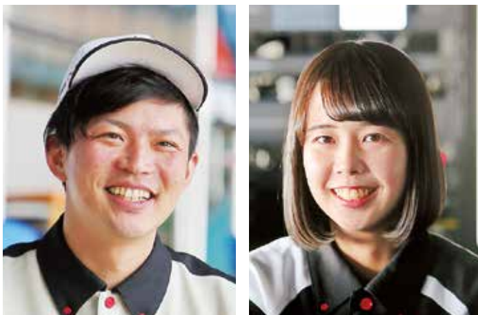
Interviewees AWS CO., LTD Shirahama Office