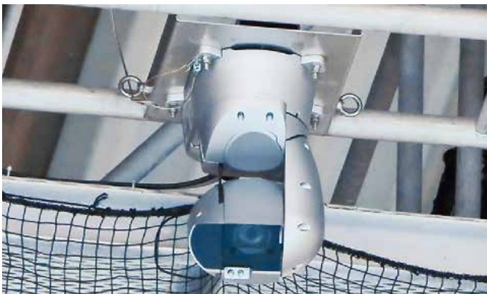
The AW-HR140 installed on the ceiling enables the venue to be filmed from end to end

When asked about these functions, Mr. Nakano had this to say: "I used to feel like it was hard to look at the glare reflecting off the water, but now, that discomfort is gone. And when we shot a night show for the first time with these cameras, I was shocked by how beautiful the image was. Even places where it was too dark to capture anything came out bright and clear. These images bring to life the charm of the dolphins, both day and night."