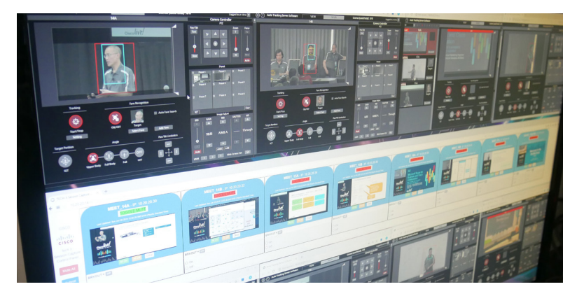
Eight PTZ camera feeds can be monitored on a single screen.