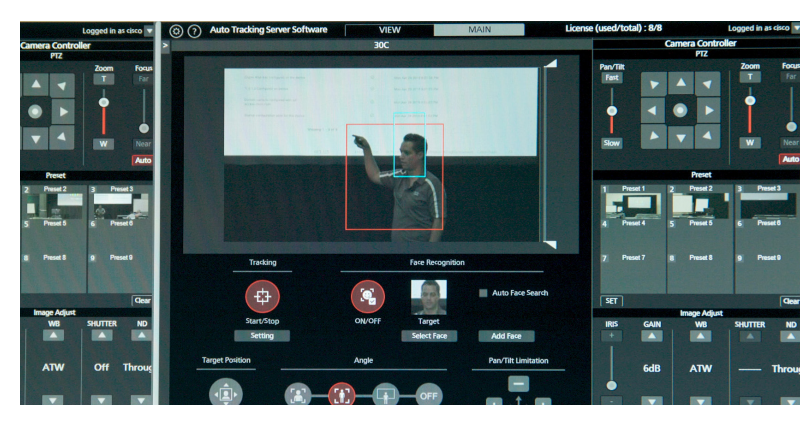
Facial and body type detection is possible with SF200 software.

"Also, we needed to find a solution that was fast enough to track our presenters without interaction. Pretty much every other system we saw required some level of cooperation or interaction from your target. And that is something we just can't accomplish when it comes to speakers who sometimes have only two to three minutes to get up on stage and start their presentation. The last thing they're going to do is wait for you to take a picture of their side and their front."