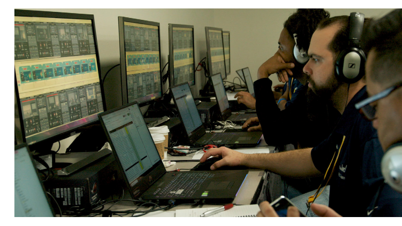
One operator can monitor eight AW-UE70s on a single laptop.

Eight operators managed the A/V equipment in the 63 rooms from a centralized control room, with an A/V manager on hand to monitor servers and the network. The task of each operator was to monitor and assist the Auto Tracking of the AW-UE70W/K PTZs, to register a face and