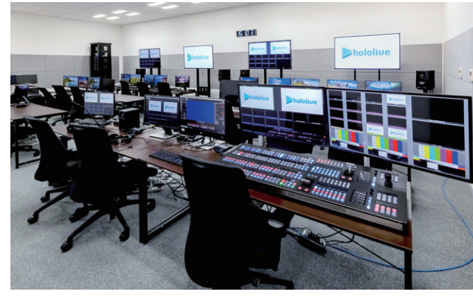
▲ Control room, where videos from rendering PCs are converted to ST 2110 and consolidated in KAIROS