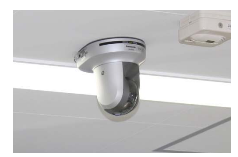
AW-HE50HN installed in a Chinese food training