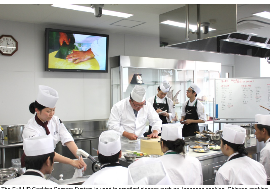
The Full-HD Cooking Camera System is used in practical classes such as Japanese cooking, Chinese cooking and confectionery classes. This picture is taken at a Chinese food training kitchen