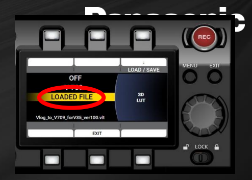
4. Select LOADED FILE using the dial