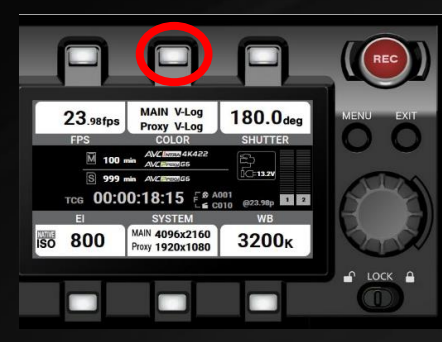
1. Press Color Button