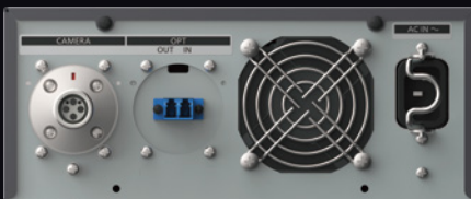
AK-CFA100 Rear View