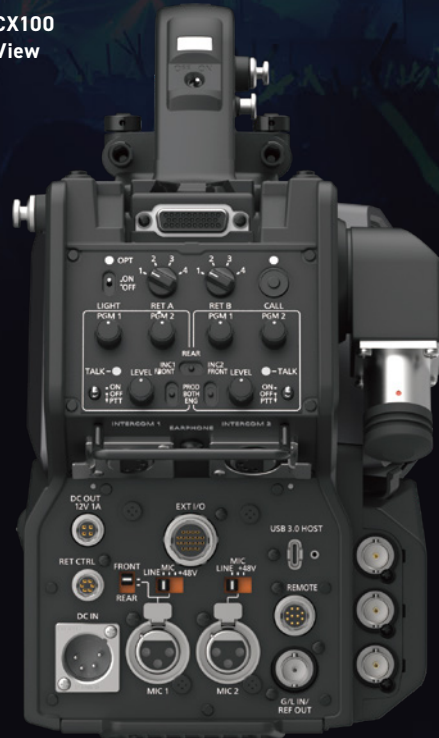
AK-UCX100 Rear View