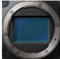
Sensor in AW-UB50

The AW-UB50 boasts a 24.2-megapixel full-size MOS sensor and the AW-UB10 features a 10.3-megapixel 4/3-inch MOS sensor, both realizing high-quality video with excellent color reproduction and resolution. The high-sensitivity, large-format sensors achieve a shallow depth of field for emotional expressiveness with beautifully blurred backgrounds. In addition, detailed expressions can be captured even in low-light environments thanks to wide dynamic range (AW-UB50: 14+ stops / AW-UB10: 13 stops).