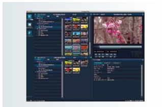
P2 Viewer Plus Viewing Software*3 Supports P2HD. This Windows/Mac utility makes it easy to view and copy P2 files.