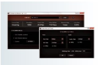
P2 Streaming Receiver Streaming Receiver Software*5 Enables receive QoS (Quality of Service) mode. Windows only, not supported by Mac.