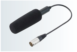
AG-MC200G XLR Microphone