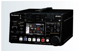
AJ-PD500 "P2 portable deck" Memory Card Recorder AVC-ULTRA and microP2 supported. A half-rack size recorder for a high-quality, cost-effective workflow