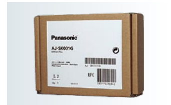
AJ-SK001G (for P2 Viewer plus) Ingesting Function Software Key*4 The ingesting function copies all clips on P2 cards to a storage medium, such as an HDD. During ingesting, the clips are verified for secure copying, with log files created.