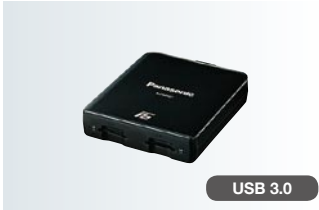
AJ-MPD1G "microP2 drive" Memory Card Drive Compact, lightweight, cost-effective USB-Bus powered microP2 card drive with USB 3.0 support and 2 card slots.