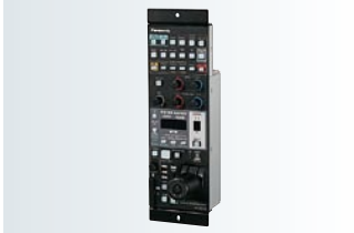
AK-HRP200G Remote Operation Panel (ROP)