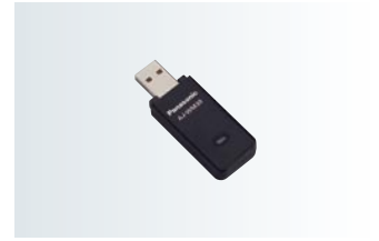
AJ-WM30 Wireless Module