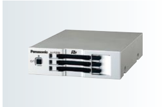
AJ-PCD30 "P2 drive" Memory Card Drive 3-slot drive with USB 3.0 interface for high-speed 1.5 Gbps data transfer.