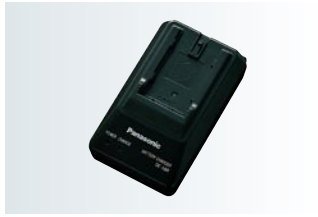
AG-B23 Battery Charger