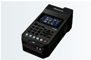
AJ-PG50 "P2 field reorder" Memory Card Recorder A portable field recorder with AVC-ULTRA codec and microP2 card compatibility, network function, and battery operation.