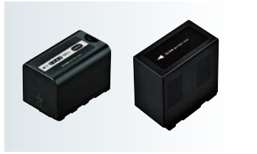
VW-VBD58 Battery Pack (5,800 mAh) CGA-D54/CGA-D54s Battery Pack (5,400 mAh)