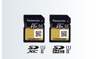
AJ-P2M064AG AJ-P2M032AG microP2 Card