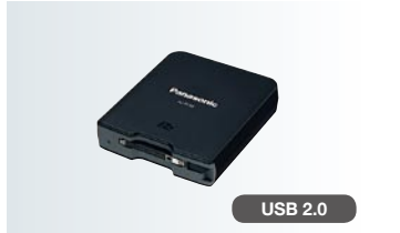
AJ-PCD2G "P2 drive" Memory Card Drive USB-Bus powered 1 slot P2 drive Ideal for mobile application.