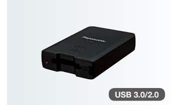
AJ-XPDI "P2 drive" Memory Card Drive*2 1-slot card drive for an expressP2 card/P2 card with bus power from a USB 3.0/2.0 interface.