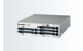
AJ-PCD35 "P2 drive" Memory Card Drive High-speed PCI Express interface.